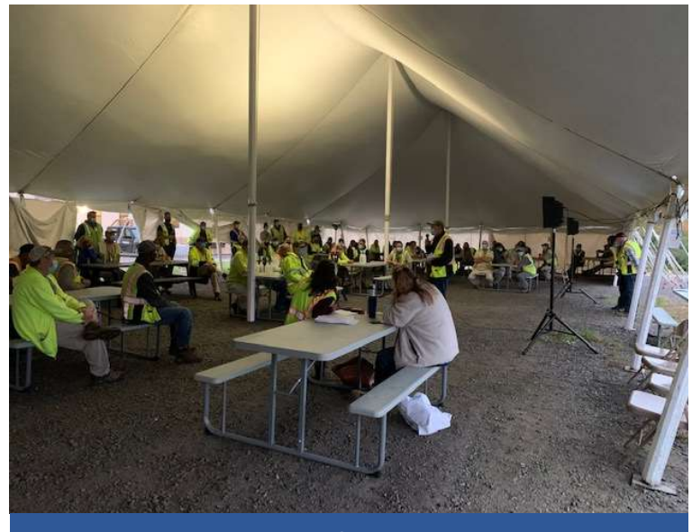
All-employee briefing on vaccinations