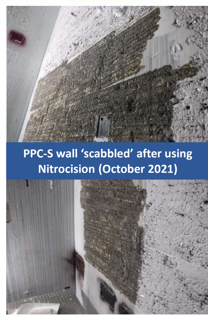
Scabble - Decontamination by removing 1/8" of the surface (debris is safely collected in a vacuum system for disposal)